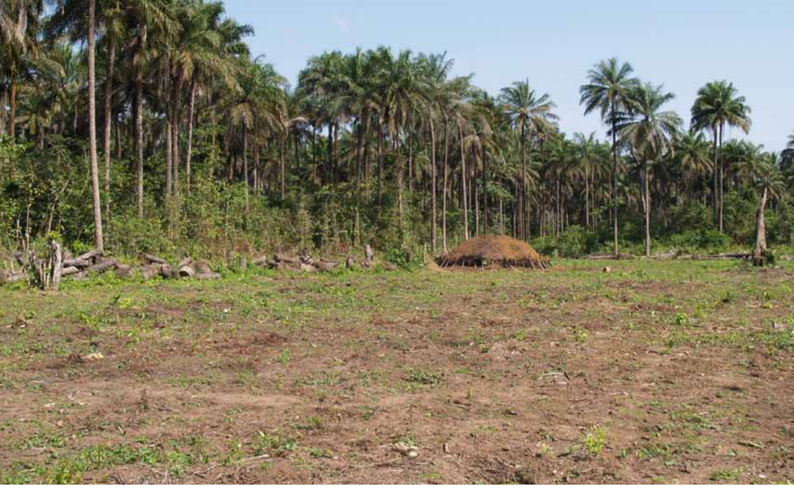
Clearing fallow land in Quifel's Petifu site

a fruit juice processing plant in a new special economic (tax free) export zone in the country.207 However, other sources say the company still plans to produce oils that can be used for the production of agrofuels.208 It is possible that Quifel plans to produce both oil crops and food crops, depending on varying market values. According to OI correspondence with the company, Quifel stated,