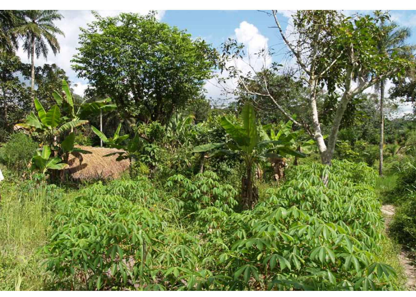
Cassava and sesame beans on a family farm

Today, Sierra Leone remains a net importer of food, with an estimated 80,000 metric tons of the staple rice entering the country in 2010.44 The country, however, is seeing an improvement in its own food production. In the second half of 2009, food imports dropped to USD 15 million (down from USD 32 million for the first half of 2009), driven largely by a substantial increase in domestic rice production due to an expansion in areas of cultivation. Food security remains a top government priority under President Ernest Bai Koroma's "Agenda for Change," and debate continues as to how agricultural development and food security can best be achieved.