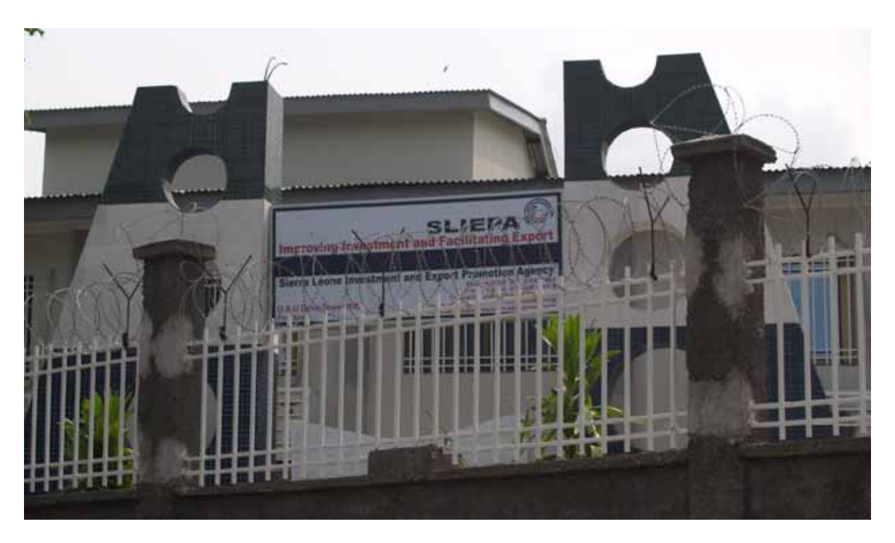
SLIEPA office, Freetown

Based on weak and often contradictory policy documents, it is clear that a number of loopholes exist, which allow investors to bypass negotiation with the appropriate ministries and other government agencies, resulting in a lack of oversight and monitoring of land deals. Indeed, OI research confirms that many investors with land leases in Sierra Leone have signed no formal agreement with government ministries.