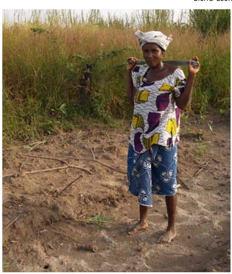
Woman farming on Addax leased land - unaware of the project

these recommendations implemented, and until a complete inventory of foreign land holdings in the country is carried out and made public, international institutions and donor partners should discontinue support for large-scale land acquisitions in Sierra Leone.