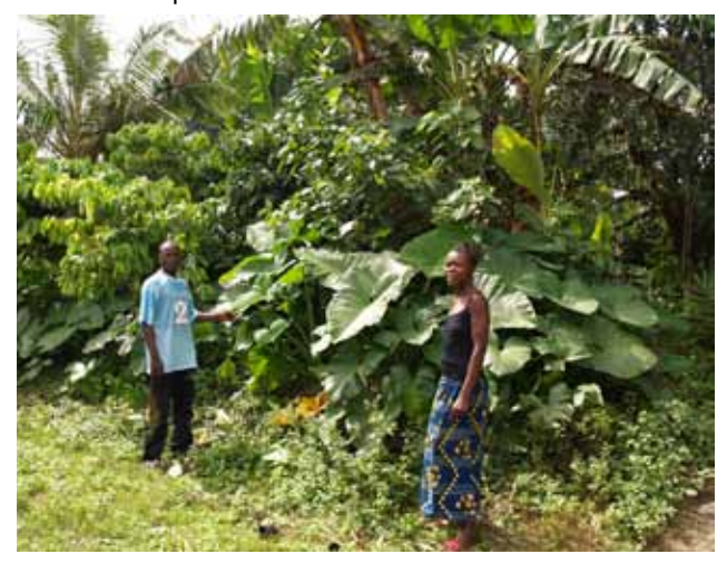
Family Farmers with diverse crops and bush fallows

The World Bank Group has been instrumental in increasing foreign investment in Sierra Leone by funding institutions and leading reforms to attract investors and to ensure their access to land and resources. In particular, the IFC provides financial support and works closely with SLIEPA.261 The World Bank Group is also financing a hasty process of land tenure reform. There are concerns that reform measures, in their desire to accommodate foreign investors, are overlooking the issues of equitable and secure access to land for all