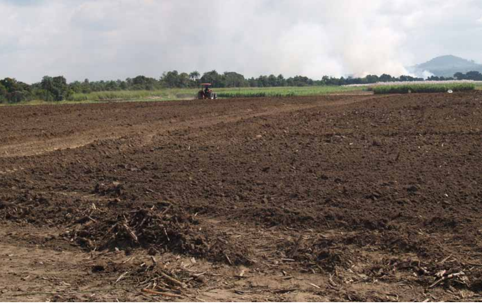
Addax clears Bolilands - Lungi Acre

through a Smallholder Outgrower Scheme, which, to date, has not materialized. Furthermore, it states, "Future land for Addax should continue to be selected based on land which is underutilized, degraded/ non-arable...and, apart from avoiding physical displacement, Addax land selection strategy must be based on avoiding cultivating the lower lying swamp land currently used for rice production."172