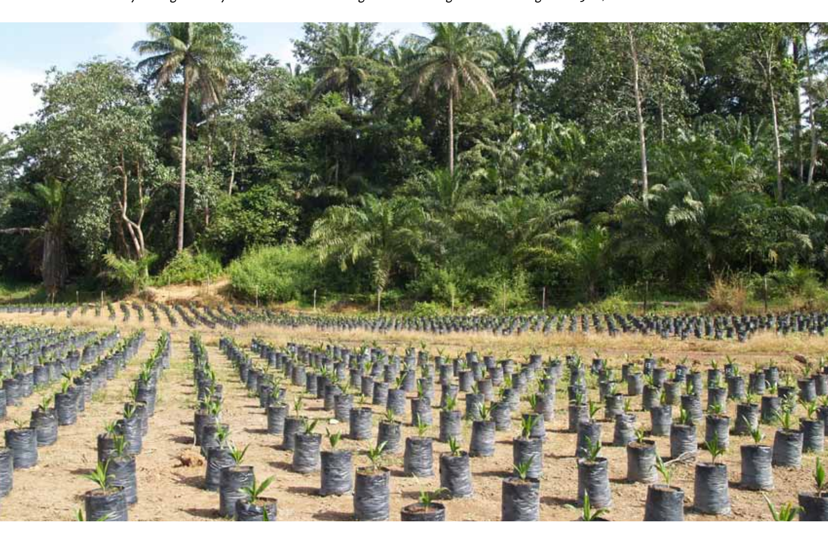
SLA palm nursery backed by rich forest

large-scale, industrial cultivation of sugarcane or palm oil. However, based on the following projections (see Tables 2 and 3), and on SLIEPA promotional materials showing "target" areas for large-scale land leases for sugar and palm oil,138 OI estimates that the actual figure for land leased, or soon to be leased, is likely much higher than the figure of 500,000 ha.