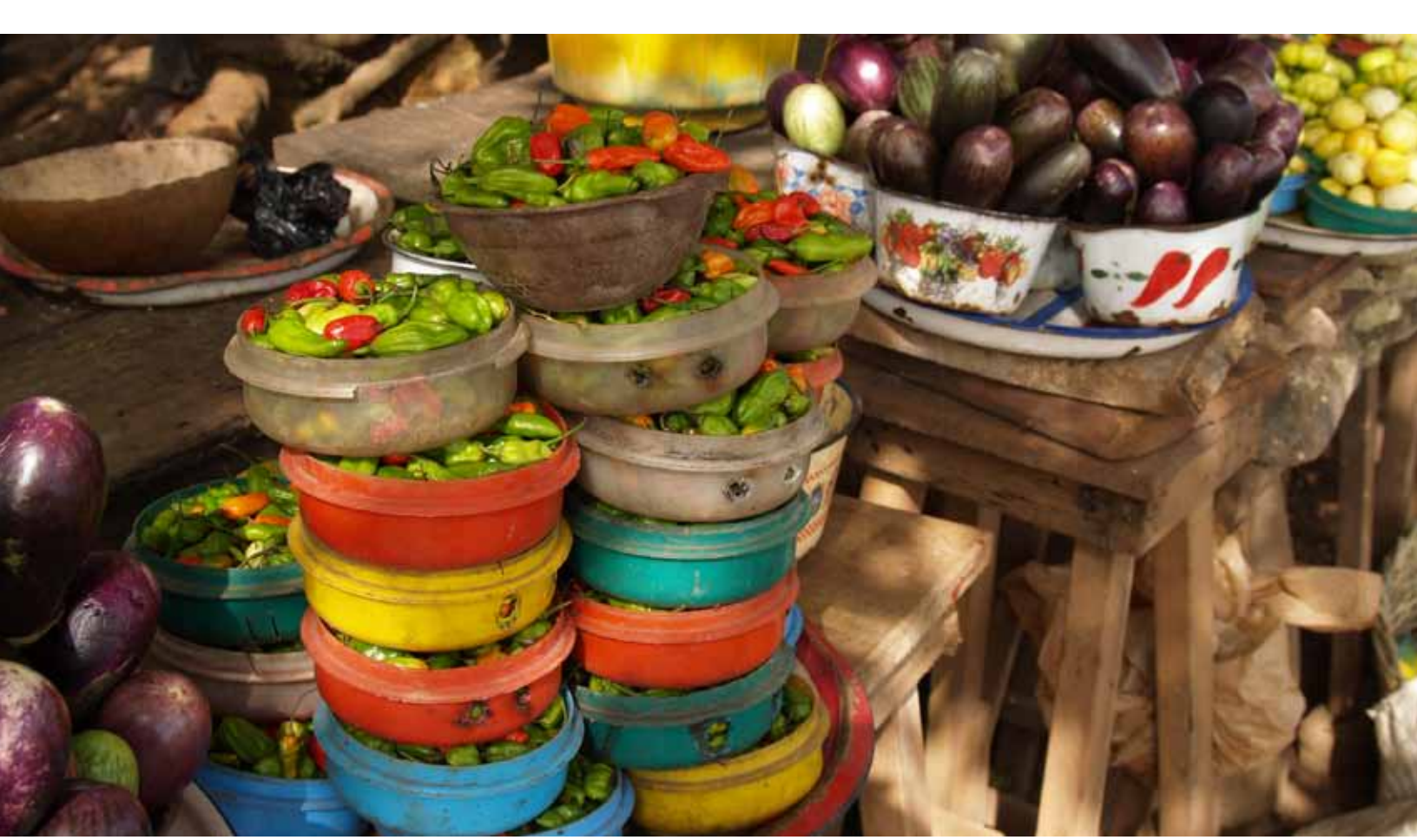
Roadside vegetable market - Addax lease area

"Numerous public town hall meetings, formal presentations, and consultations have been held in