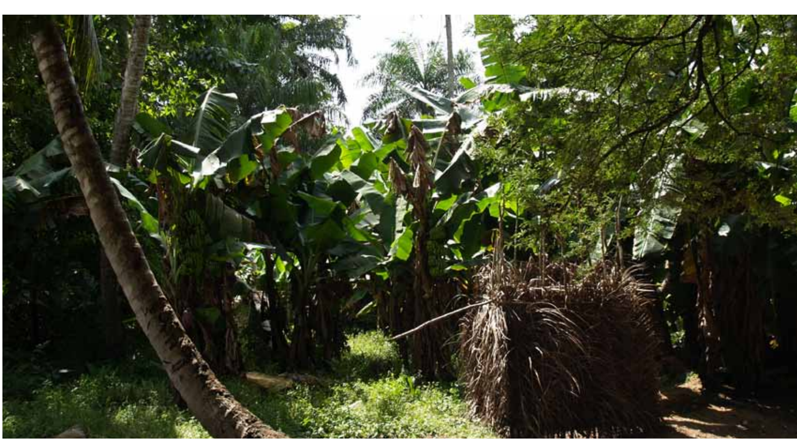
Rich fallows in the Quifel lease area

The aforementioned 2004 government review of agriculture states that the bush fallow farming system predominates in Sierra Leone, and occupies 60 percent of the arable land "at the date of the last census" (completed in 1984-85), with smallholdings usually ranging from 0.5 to 2.0 ha of cultivated land under food crops. The report also affirms that this kind of farming accounts for about 60 to 70 percent of agricultural output and employs two-thirds of the farming population."117 If, in fact, 60 percent of arable land is occupied by the bush fallow farming system (or was in 1984-85 when the population was half of what it is today), then a majority of cultivatable land in Sierra Leone is indeed being "used" by smallholders.